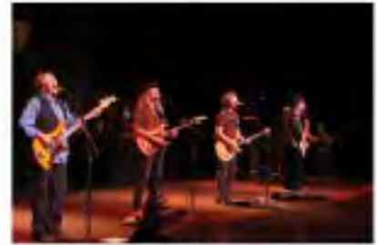
The Blue Stripes