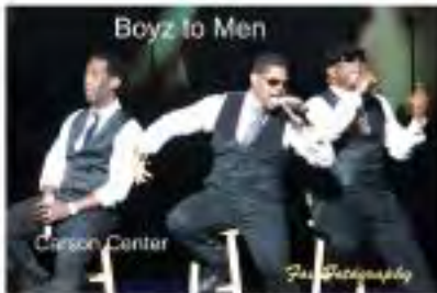
Boyz to Men