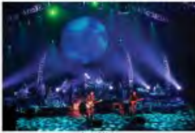
Luggan & Cousins