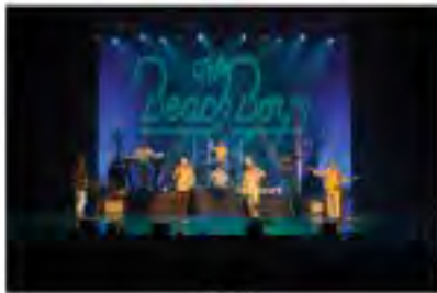
The Beach Boys