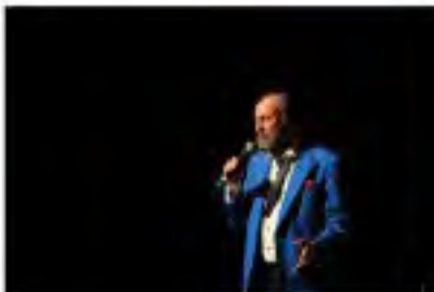
Ricky Van Shelton