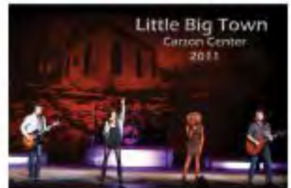
Little Big Town Carson Center 2011